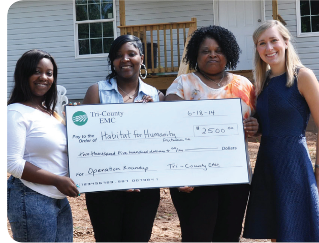
Habitat for Humanity of Putnam County received a grant for $2,500 for construction on a home scheduled to be complete this fall.

Crossroads Baptist Church: $2,000 to help cover medical expenses for an individual with colon cancer in Putnam County.