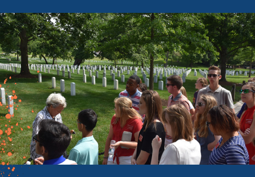
SUPREME COURT TOUR