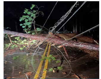
Downed lines caused by severe weather back in January

Outages are caused in a number of ways. In this scenario, a tree has fallen across a main distribution line, resulting in loss of power for a large number of homes and businesses. Due to the danger of energized lines and a dark working environment, Tri-County EMC linemen must exercise extreme caution and identify all potential hazards before beginning repair.